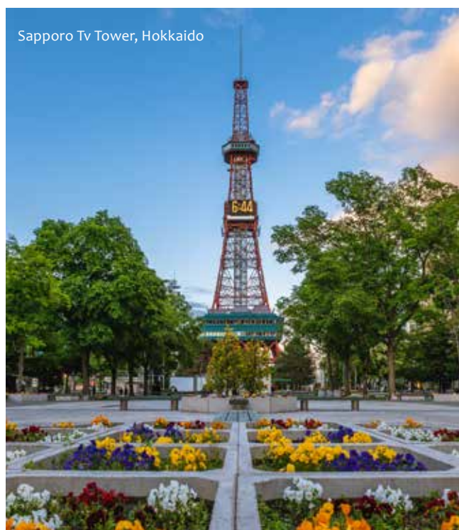
Sapporo Tv Tower, Hokkaido