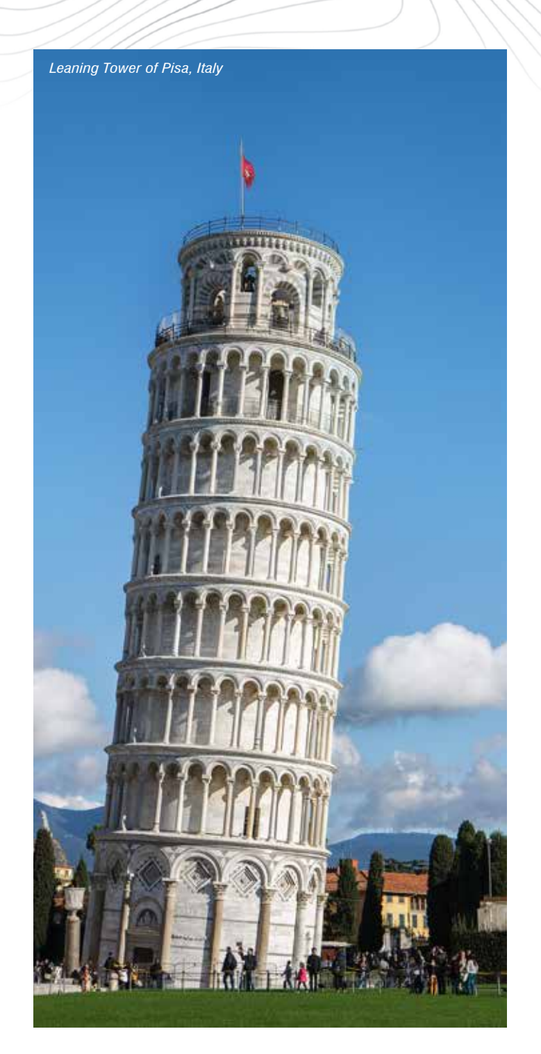
Day 9: Lake Como - Fly back home with pleasant memories

Today, we check out and first proceed to Lake Como. Here you can relax or take a walk along the scenic lakeside. Then we drive to Milan airport for your flight back home. Kindly spare a few minutes to share your feedback with your Tour Manager. Your valued suggestions will be most appreciated. Arrive home with pleasant memories of your Europe tour, which we are sure you will treasure for a lifetime. (B)