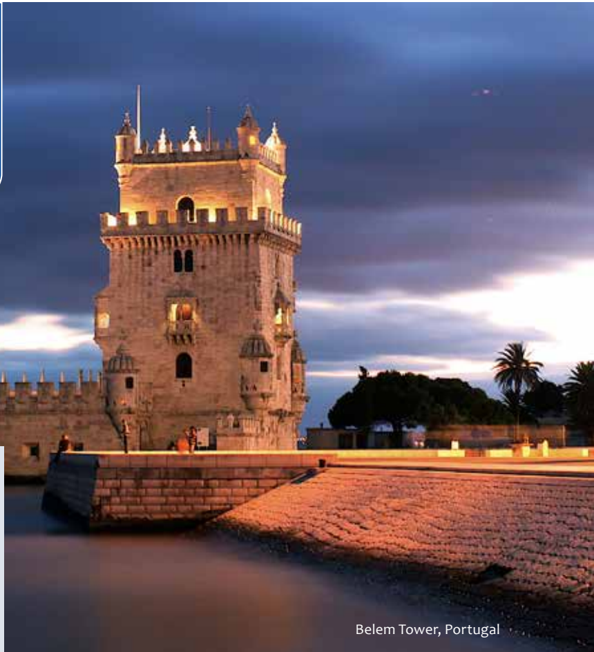
Belem Tower, Portugal