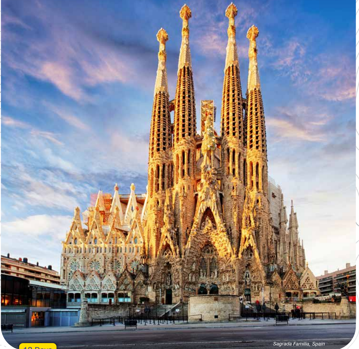
Sagrada Família, Spain