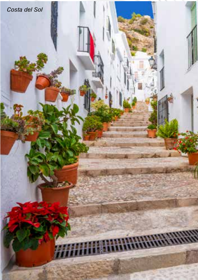
Costa del Sol