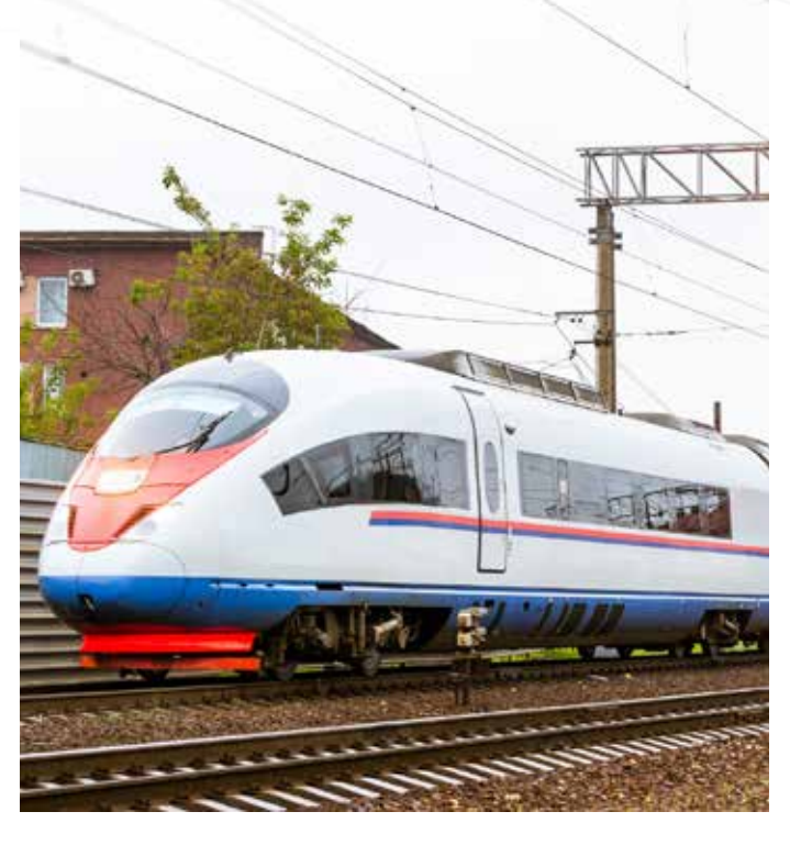
Day 1: Welcome to Moscow!

On arrival, our Tour Manager / Station Manager / Local Representative will meet and welcome you outside the Airport. Later, we proceed to the hotel and check-in.