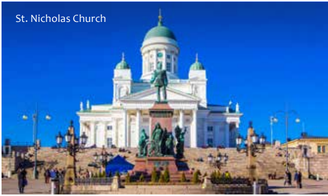
St. Nicholas Church