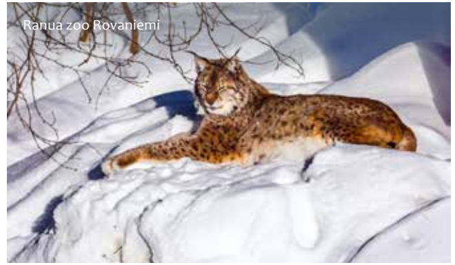
Rauna zoo Rovaniemi

Today, we visit the reindeer and husky farms. Meet the authentic reindeer herder and take photos of the reindeer. Next, we visit the Santa Claus Village and the numerous souvenir shops, Santa’s Post Office and surely, we get to meet the man himself in his office. Santa Claus Village in Lapland is a popular place to cross the Arctic Circle: