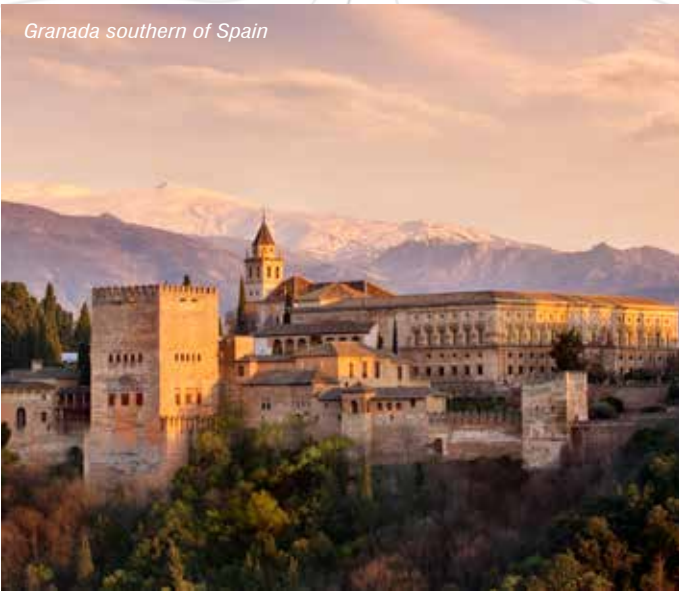
Granada southern of Spain