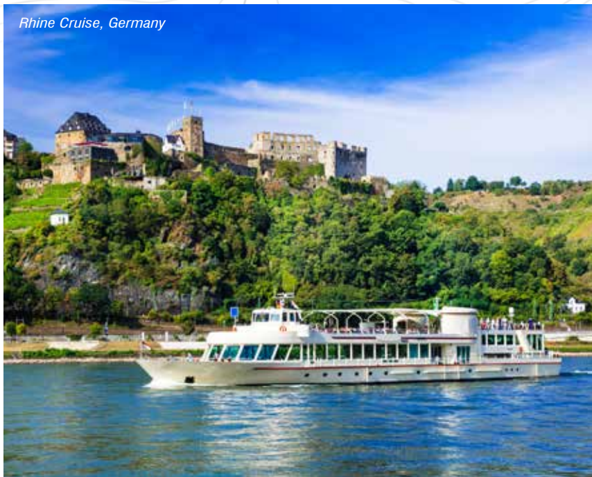
Rhine Cruise, Germany